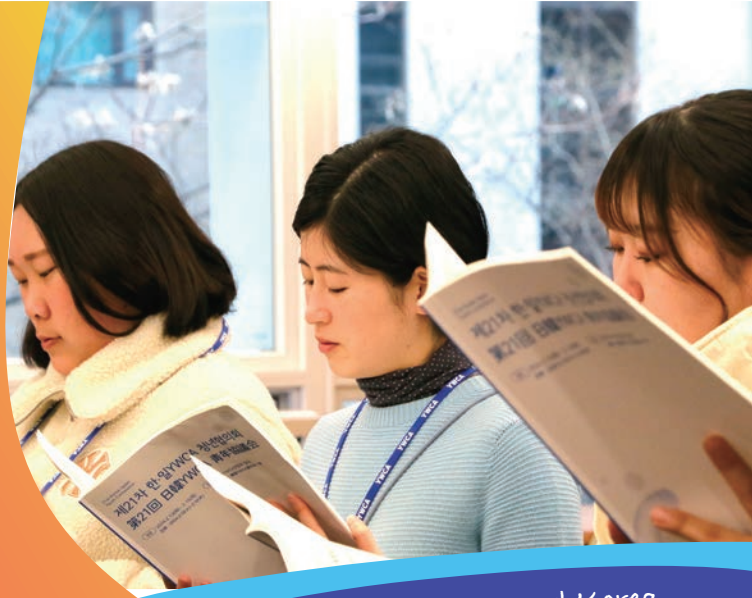
Youths from Japan and Korea explored the idea of "Peace" together