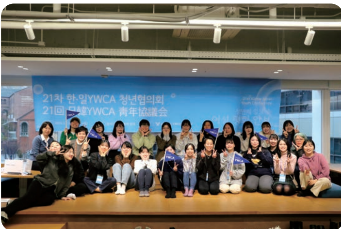
Group photo on the final day