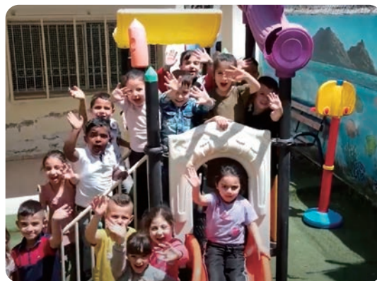
Kindergarten children in the refugee camps

In 1948, more than 500 villages were destroyed and occupied by Zionist military forces, more than 10,000 people were killed, and the State of Israel was founded on the stolen land. Even now, Palestinians who became refugees are unable to return to their homeland, and many have lived in refugee camps for several generations. To support the children's physical and mental wellbeing, the YWCA of Palestine operates kindergartens in the refugee camps of Aqbet Jaber (Jericho) and Jalazone (Ramallah), creating a place where children living under military occupation can learn creatively, grow up healthy, and develop confidence.