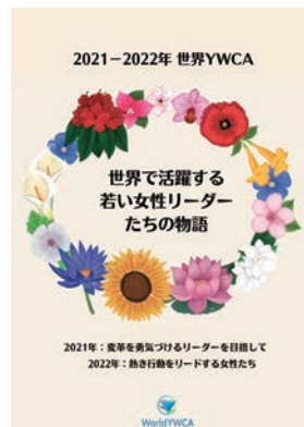
Inspiring Leaders Aspiring Action