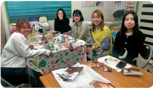
Activities at Caro Fukushima

The YWCA of Japan's support activities for the survivors of the Great East Japan Earthquake are planned and operated with the determination to continue supporting children born on the day of the disaster, until they become 20 years old. 2023 was another year of efforts to provide support for the future, while facing the challenges that arise every day.