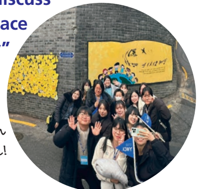
Field trip in Seoul!

19 youths gathered in Seoul to discuss "Women, Peace and Security" together.