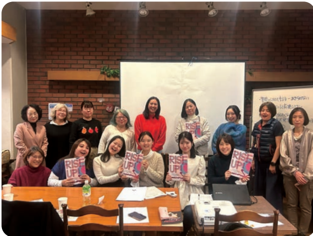
Participants in Yokohama YWCA