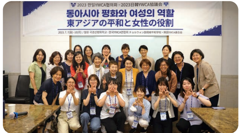
Posing with the sign "W" for Women

The "Korea-Japan YWCA Conference," a gathering of representatives from the YWCA of Japan and the National YWCA of Korea, was held under the same theme as the Korea-Japan Youth Conference held in the same year: "Women, Peace, and Security (WPS)". In addition to reports on the activities of each YWCA and exchange of opinions, participants visited Tieluan County, located in the DMZ (demilitarized zone near the 38th parallel of north latitude), and felt the pain and thought about peace in the face of the reality of the division between the North and South. On the last day, they released a statement "We oppose the Discharge of Contaminated Water from TEPCO's Fukushima Daiichi Nuclear Power Plant Accident into the Ocean" and held a press conference for the local media. After four stimulating days inspired by the power of the National YWCA of Korea to push the movement forward, the YWCA of Japan is committed to work for even more active collaboration between the YWCA of Japan and Korea.