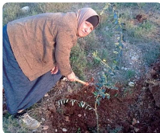
A woman from Nablus. She was able to plant 50 olive trees in her farm which was formerly destroyed by settlers.

For every 3,000 yen donated, one olive tree sapling is delivered to Palestine. Donations collected through YWCA of Japan in 2023 has amounted to 309 olive trees in 2023.