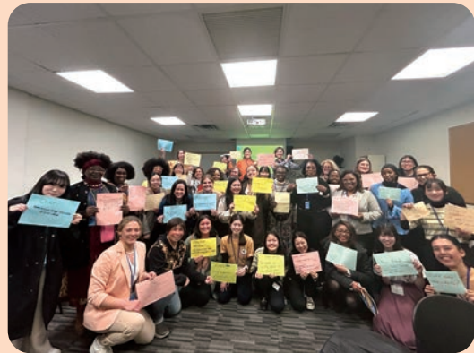
Group photo with participants after the parallel event

The members of the delegation for this year were diverse in age and background. We shared heated discussions every day and were able to further deepen our learning. I am very happy to have met such wonderful members who are honest, passionate and ambitious. (A.K.: Tokyo YWCA) ”