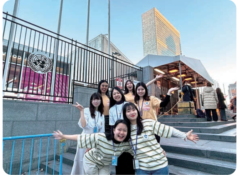
In front of the United Nations building