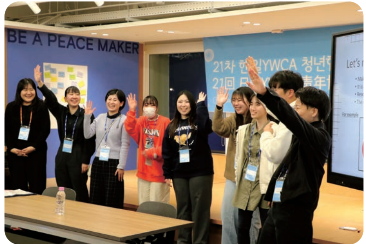
Participants of Korea-Japan Youth Conference

*The Korea-Japan Youth Conference is supported by donations to Peacemakers Fund.