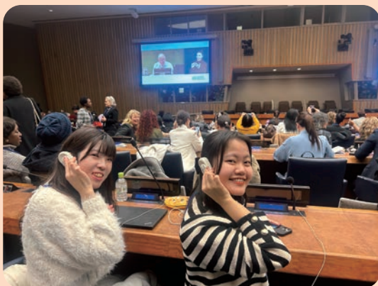
Attending the CSW opening plenary session in the United Nations building

“ I had the rare opportunity to attend an event hosted by the YWCA of Palestine, and to gain a better understanding of the current situation in Palestine.