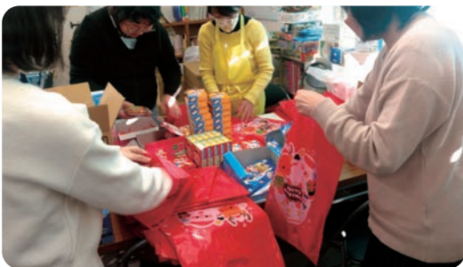
Distributing food at Food Pantry activity