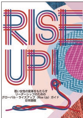
RiseUp! Guide for Young Women's Transformative Leadership

The World YWCA publishes books that serve as tools for leadership training of young women. With the help of volunteers, the YWCA of Japan published the below documents in Japanese language.