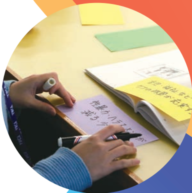
Workshop: Envisioning the future