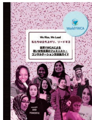
The World YWCA's Young Women-Led Feminist Consultation Methodology Guide

Japanese versions can be downloaded or purchased on the YWCA of Japan website.